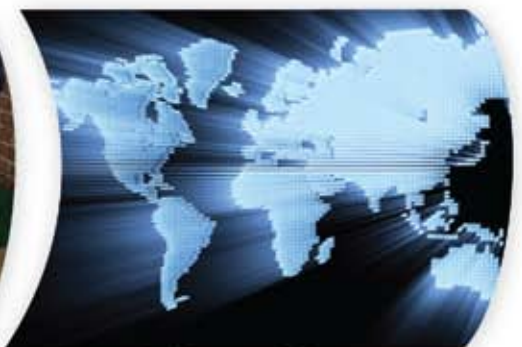
Local & Long Distance