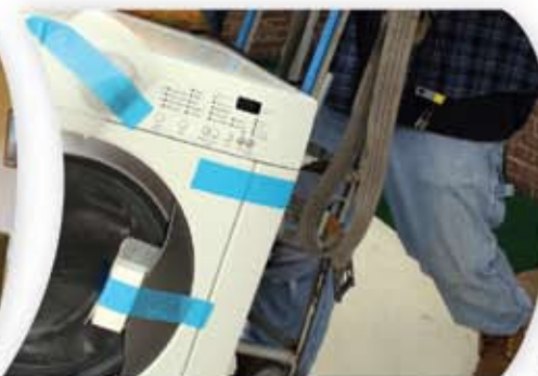
Residential & Commercial