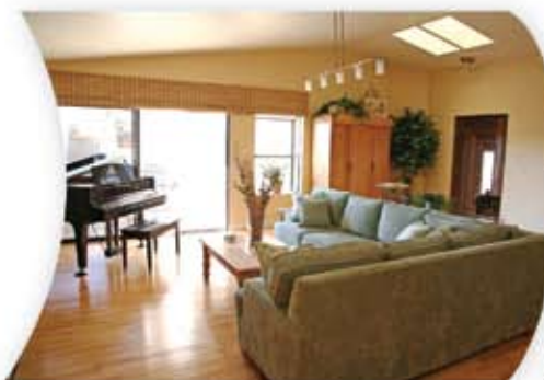
Artwork & Antiques