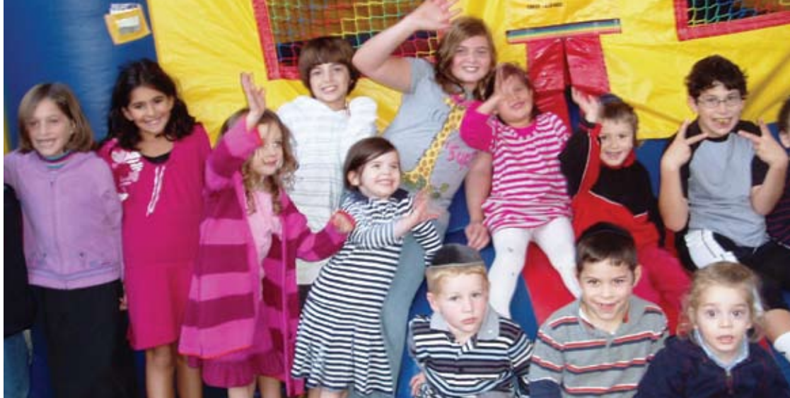
Torah Links Sukkah Party for Kids